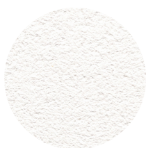
Hz Acoustic Plaster 03