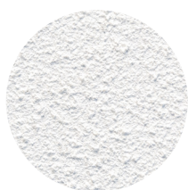
Hz Acoustic Plaster 09